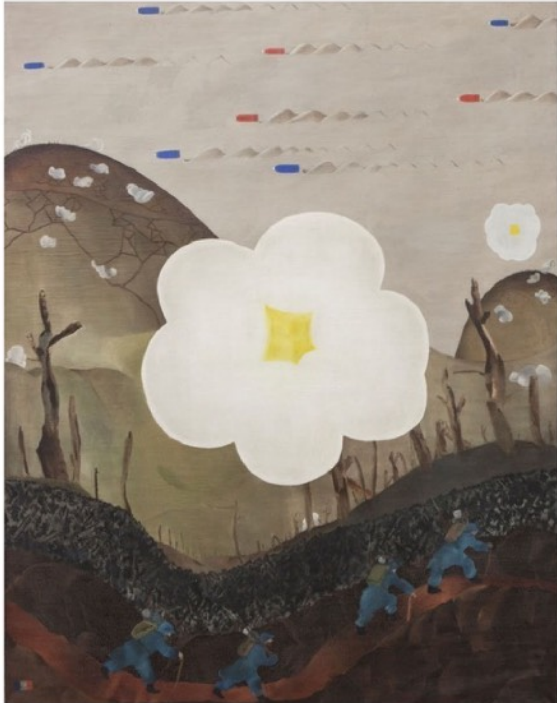
Per Krogh: The Grenade (1916)

in problems relating to form, in a modernistic manner - though these are important for him - but who also has given particular attention to existential questions, often given actuality through contemporary events and happenings. He was, for example, one of the first to reflect in painting on the massacre at Utøya. He is often inspired by literature, such as Henrik Ibsen and Thomas Mann, and by music. He is, therefore, an artist well suited for a festival with the title "In the Shadow of War". In addition, paintings created as reactions to the First World War will also be exhibited - admittedly not originals, but nevertheless good copies - such as one of the most shocking war paintings of World War One, namely Otto Dix's The War (1932) and Per Krogh's The Grenade (1916). Together, these exhibitions will accompany the music that will be performed, an accompaniment that will hopefully promote reflection and deeper understanding.